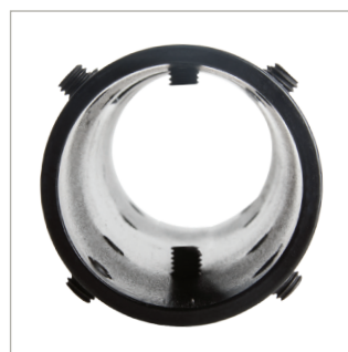
Supplied with optional short safety bolts to allow cables to pass through