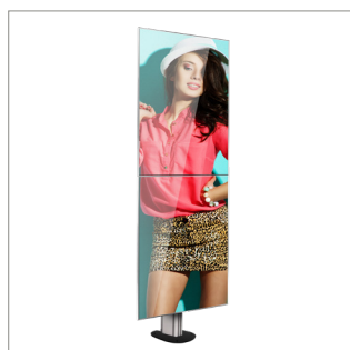
Can be used for single column installations in landscape or portrait format