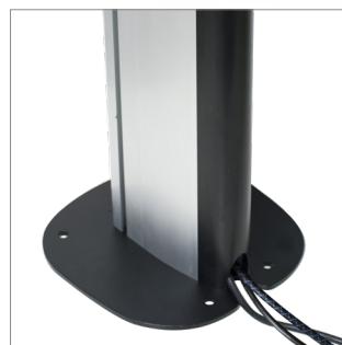
Integrated cable management for a neat and tidy installation