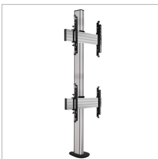
Must be used with System X mounting solutions using BT8380 vertical columns