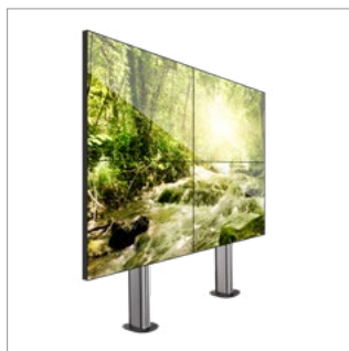
Used for a variety of fixed, freestanding or mobile video wall installations