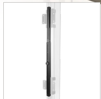
Multiple rows can be spaced apart using BT8390-SP Row Spacing Kit