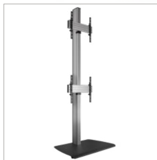
Ideal for single and twin screen System X installations