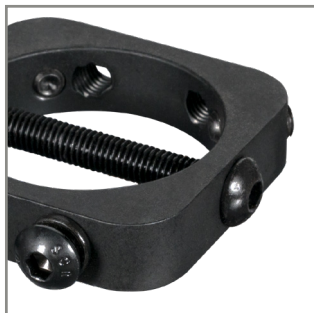
The Security Bolt ensures a safe installation on to Ø50mm poles