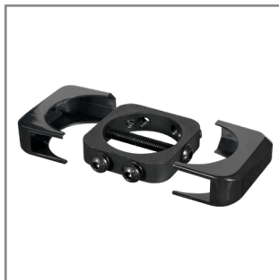
Supplied with cover plates for a neat and tidy install