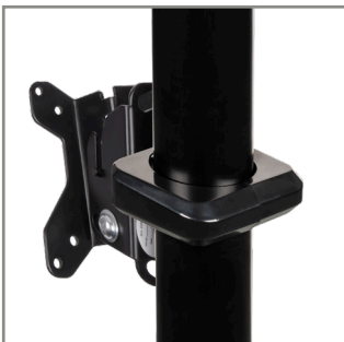
Allows a wide range of mounts and accessories to be fitted to Ø50mm poles