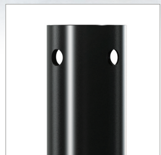
Features safety bolt holes at the top and bottom for secure installation