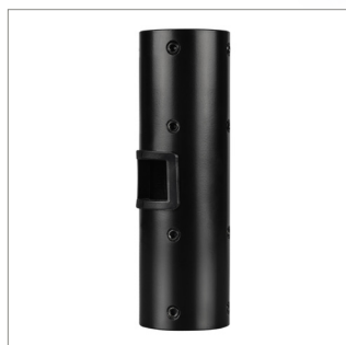
Poles can be linked together using BT7823 & BT7824 Pole Joiners