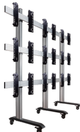
Mobile Universal Videowall Stand For 3x3 Videowalls screens up to 55"