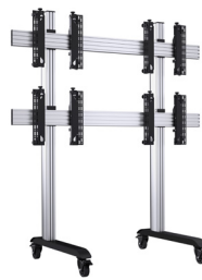
Universal Mobile Videowall Stand For 2x2 Videowalls