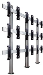
Universal Bolt Down Videowall Stand For 3x3 Videowalls