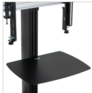
Fits System 2 compatible accessories such as shelves without using collars