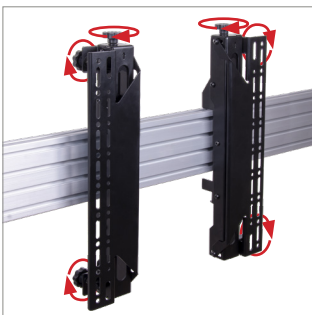
Tool-less micro-adjustment for seamless display alignment

*Please note BT8371-3X3 is available in two packages: BT8371-3X3 is designed for screens from 46"-55" and BT8371-3X3-60 is designed for screens from 55"-60".