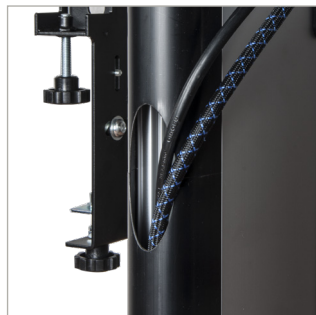
Cable management covers hides untidy cables and adds to the stylish finish