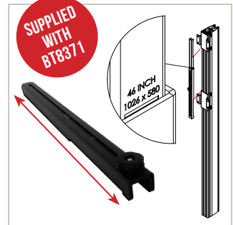
Screen spacer designed to eliminate calculations and guess work when installing horizontal rails