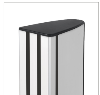
Supplied with plastic end caps, cable covers and trim strips to add to the high-end aesthetic quality