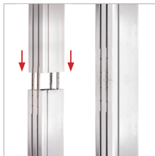
Multiple columns can be joined together using BT8380-EXTV (available separately)