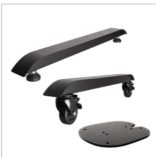
Compatible with a variety of floor bases for use in different applications