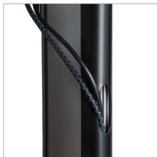
Integrated cable management for a neat and tidy finish