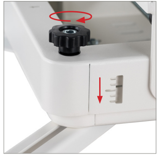
for controlled and precise adjustment of from any B-Tech Ø50mm pole the projector