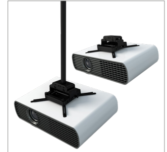
Micro-adjustment thumbwheels at 4-points Can be mounted directly to the ceiling or