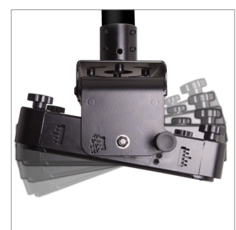
Features easy, incremented tilt adjustment