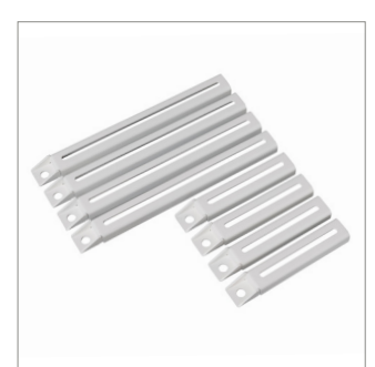
Optional extension legs can be used to accommodate larger fixing patterns