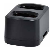
HC-92 dual-slot charger