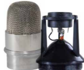
MC-85 condenser capsule