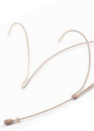
MC-76B headset mic