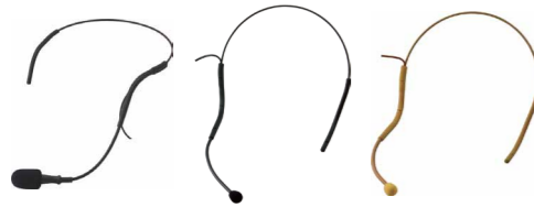
MC-77 headset mic