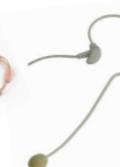
MC-73 headset mic Audio-Technica (Japan)