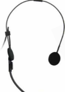
MC-76 headset mic