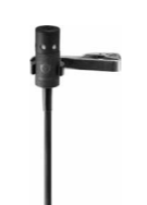
MC-61B lavalier mic