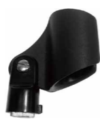
MH-31 mic holder