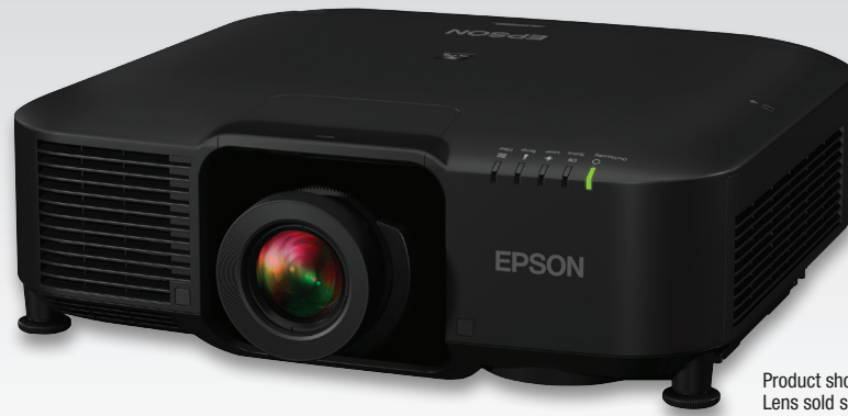
Product shown with lens. Lens sold separately.