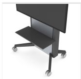
SMS Presence Mobile Shelf Grey PR100002-PO

We reserve the right to introduce changes in the product specifications after the printing and publication of this document.