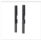
SMS Presence VESA 600 Bars PR210201